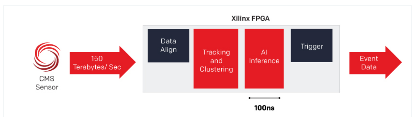
Figure 2: Compared to alternative devices such as GPUs and ASICs, FPGAs are the only viable choice for the event trigger processing because they provide extremely low latency. While the large numerical processing capability of GPUs is attractive, these technologies are optimized for high throughput, not low latency.

A growing team of physicists and engineers from CERN, Fermilab, MIT, UIC, and UF led by Philip Harris, MIT and Nhan Tran, Fermilab, wanted to have a flexible way to optimize custom event filters in the Compact Muon Solenoid (CMS) detector they are working with at CERN. The very high data rates (150 Terabytes/second) in the CMS detector requires event processing in real-time, but trigger filter algorithm development hindered the team's ability to make progress. (see figures 1 and 2) Custom event triggers typically required many months of development. Harris explained the project's genesis, "We were inspired after talking to a few people who had been working on machine learning with FPGAs from the Microsoft brainwave team and seeing on Github some very simple machine learning inference code written by EJ Kreinar using Xilinx' Vivado HLS tool. The combination of those two got us very excited because we could actually see the potential to do this hls4ml project to enable fast ML-based event triggers."